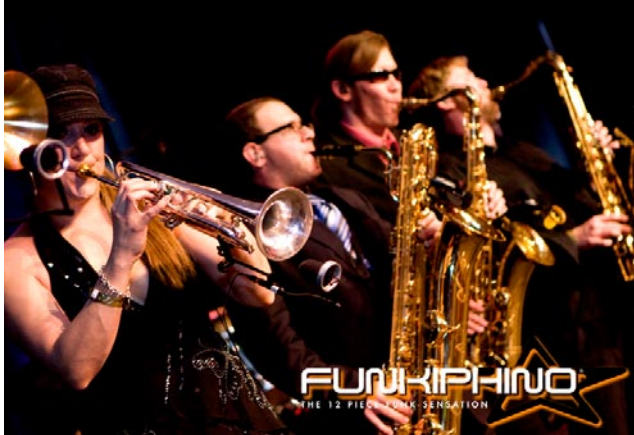
Funkiphino's Five-Piece Horn Section